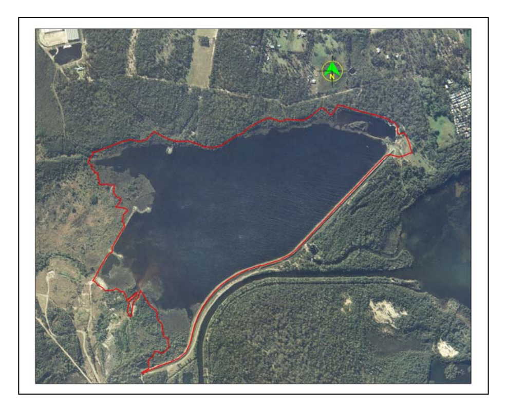
Fig 2 Munmorah ash dam

Munmorah ash dam is the smaller of the two dams with an area of approximately 105 hectares wholly comprised of a water body with a water/ash inundation perimeter of approximately 6 kilometres (Surveyed perimeter shown in Figure 2).